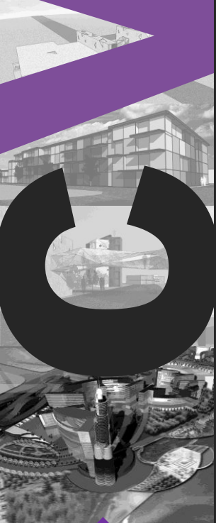
Off-Grid City-South Korea Won the 'Honourable Prize' In Incheon International Design Competition 2009